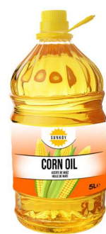
5 Lt Pet Bottle