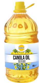
5 Lt Pet Bottle