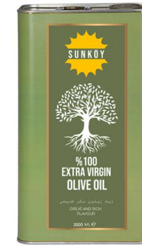
3000 ml Tin