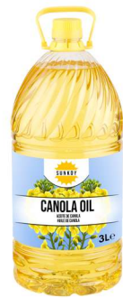
3 Lt Pet Bottle