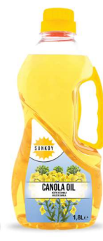
1,8 Lt Pet Bottle