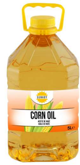
5 Lt Pet Bottle