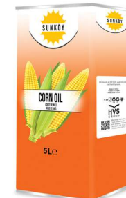
5 Lt Tin