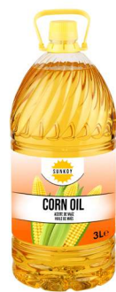
3 Lt Pet Bottle