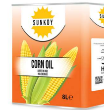
8 Lt Tin