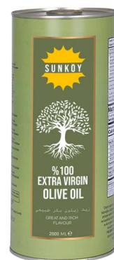
2000 ml Tin