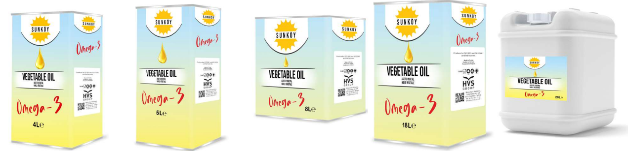
4 Lt Tin 5 Lt Tin 8 Lt Tin 18 Lt Tin 20 Lt Tin