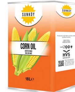
18 Lt Tin