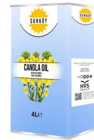
4 Lt Tin