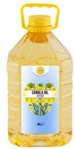
4 Lt Pet Bottle