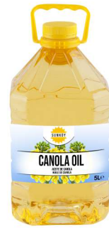
5 Lt Pet Bottle