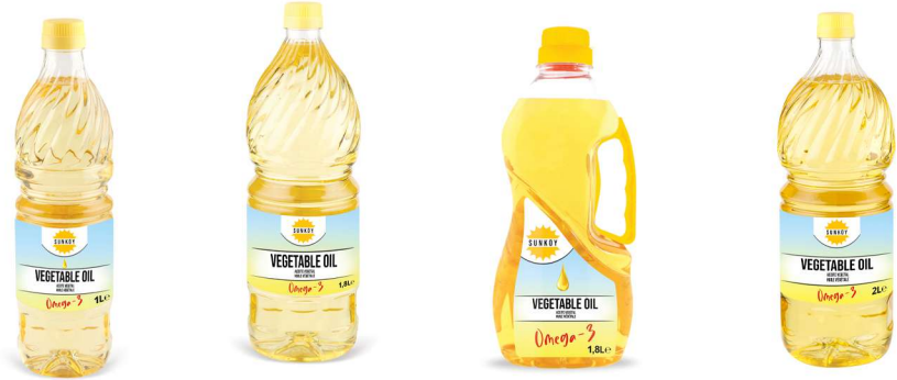
1 Lt Pet Bottle 1,8 Lt Pet Bottle 1,8 Lt Pet Bottle 2 Lt Pet Bottle