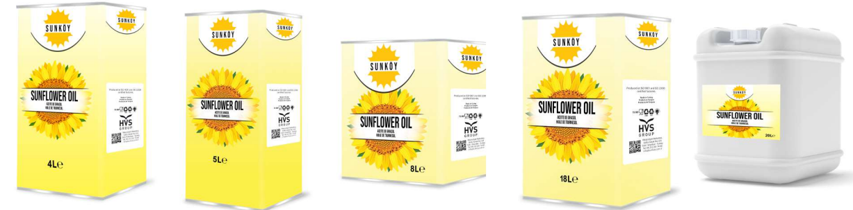
4 Lt Tin