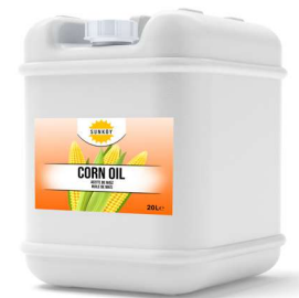
20 Lt Tin