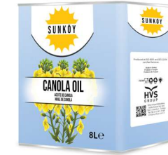
8 Lt Tin