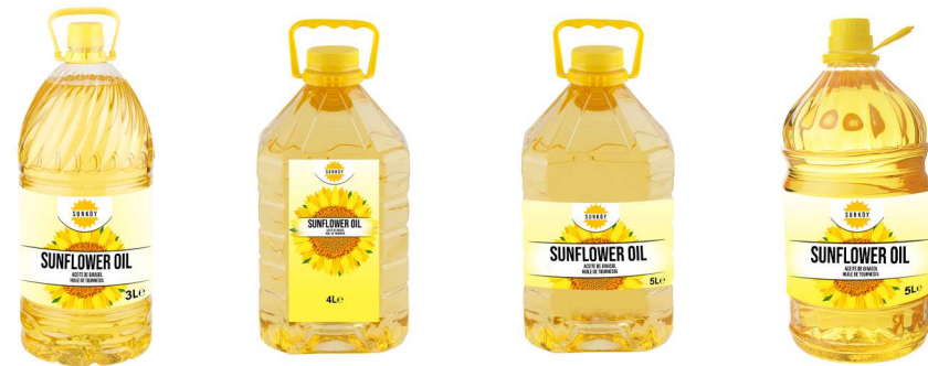
3 Lt Pet Bottle