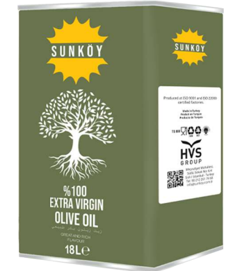
18 lt Tin