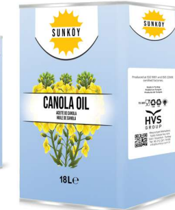
18 Lt Tin