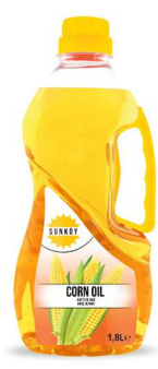
1,8 Lt Pet Bottle