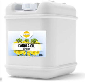
20 Lt Tin