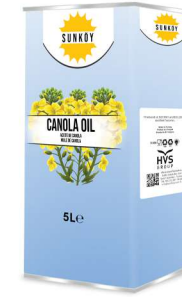
5 Lt Tin