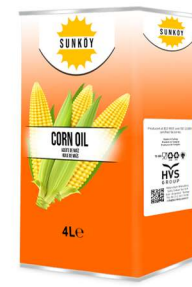
4 Lt Tin