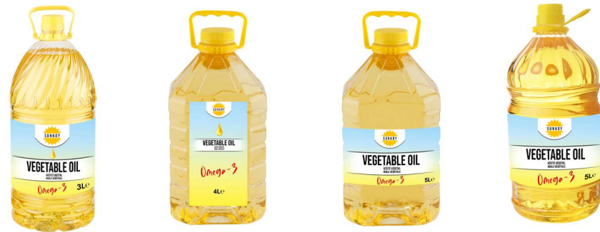
3 Lt Pet Bottle 4 Lt Pet Bottle 5 Lt Pet Bottle 5 Lt Pet Bottle