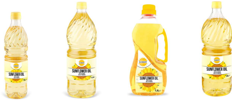
1 Lt Pet Bottle