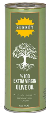
1000 ml Tin