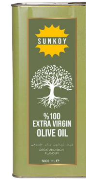
5000 ml Tin