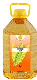
4 Lt Pet Bottle